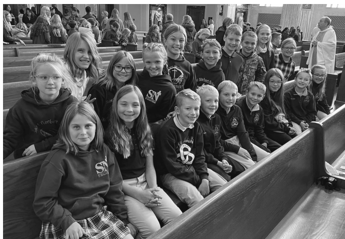
SMS 3/4 & SNS 4/5 students at the Cathedral for the annual Mission Mass.